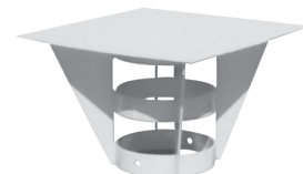
Cat. No. EWS-PMB